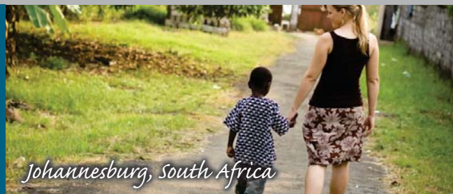
Johannesburg, South Africa

With medical coverage from 5 days to 12 months, Atlas Group Travel from HCC Medical Insurance Services (HCCMIS) is with you almost anywhere on the planet you may travel with a group of 5 or more for mission trips, large family vacations, student groups abroad, corporate groups, and overseas excursions for other large organizations.